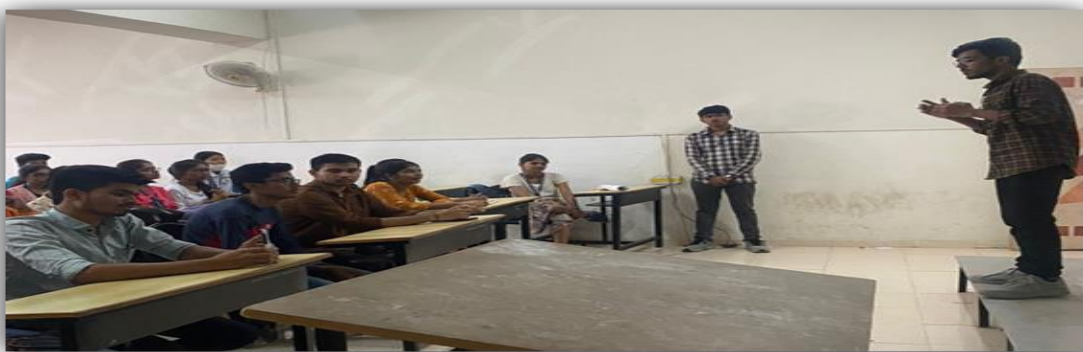
General Talks [20-05-2022]