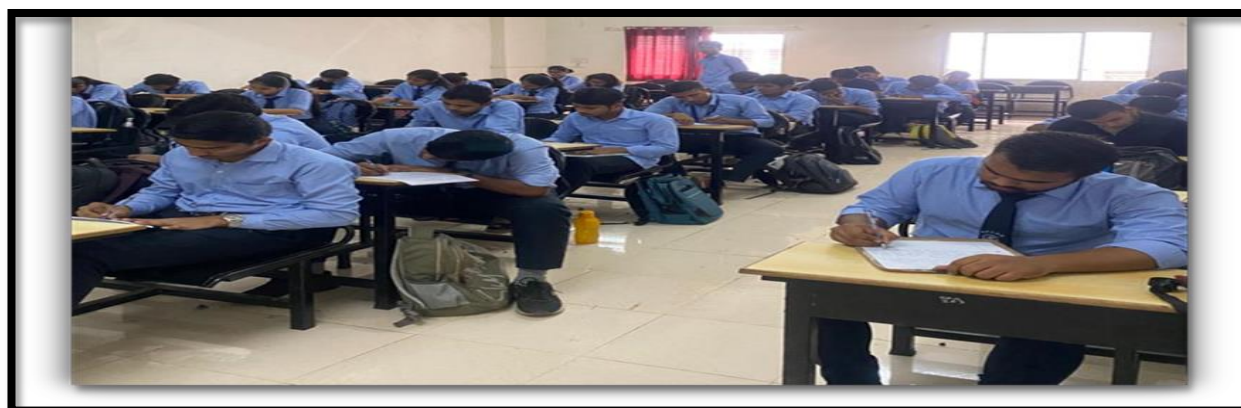
Essay Writing Session on 09-05- 2022