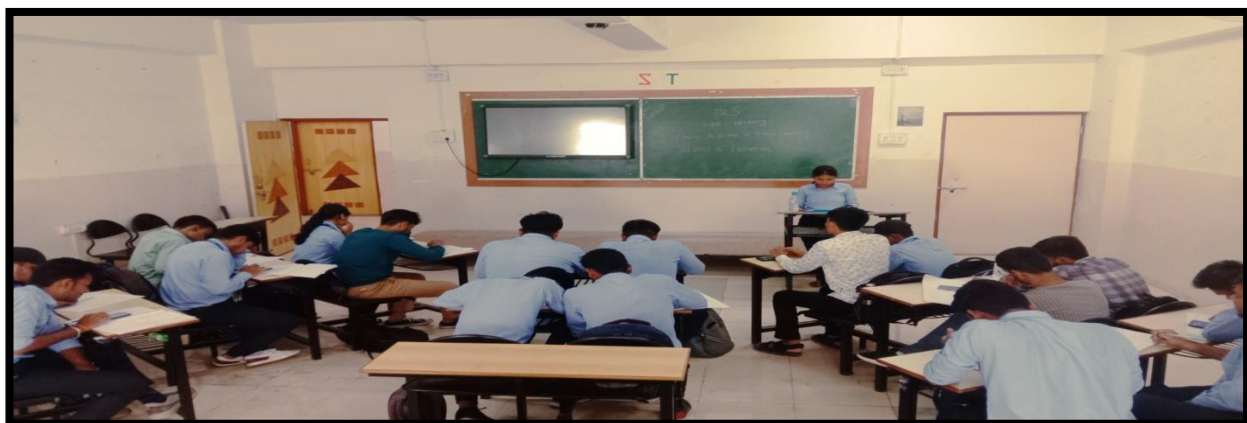
Doubt Clearing [24-05-2022]