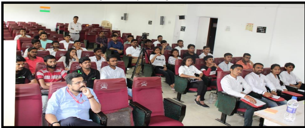
Alumni Talks Session on 17-12-2022