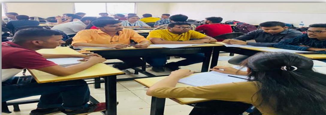
Group Discussion on 17-05-2022