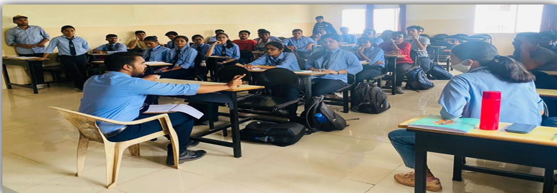
Debate 1.0 on 12-05- 2022