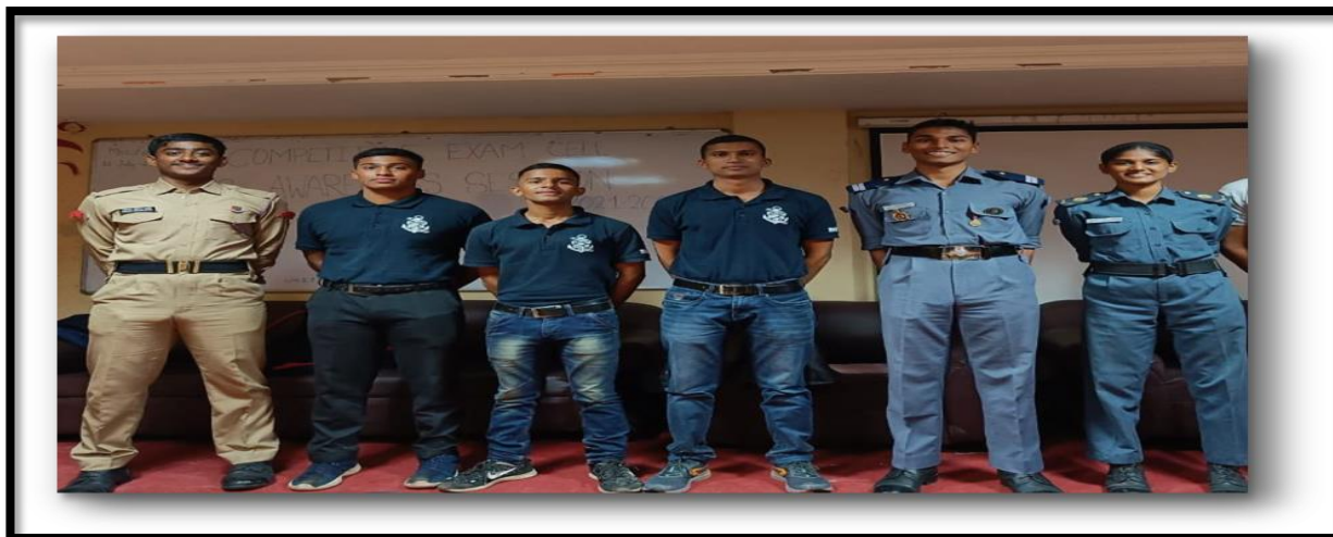
NCC Awareness on 11 -07-2022