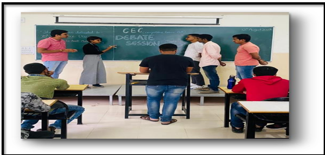
Debate 2.0 on 12 -08- 2022