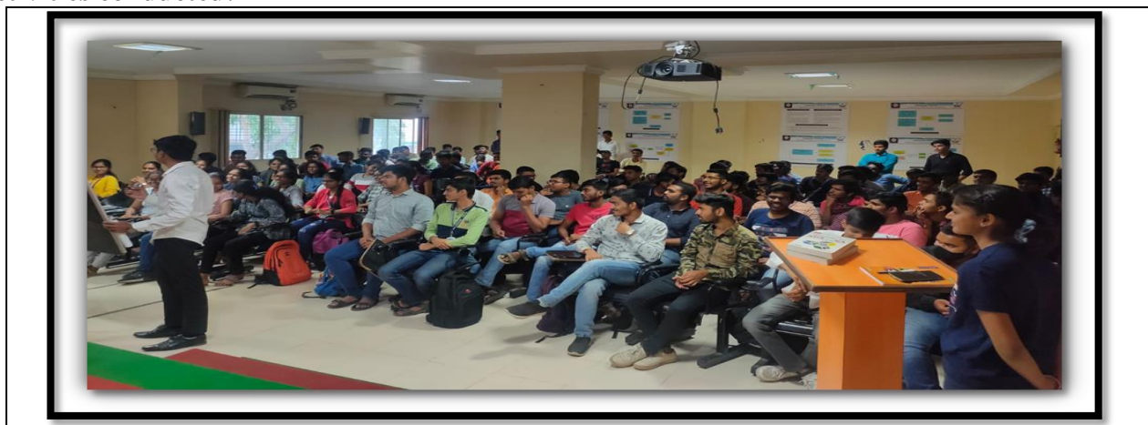
Introduction about CEC on 04-05- 2022