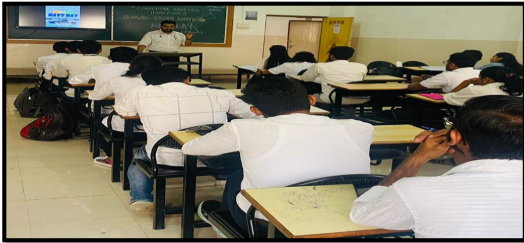
Slogan - Essay writing on 05-12-2022