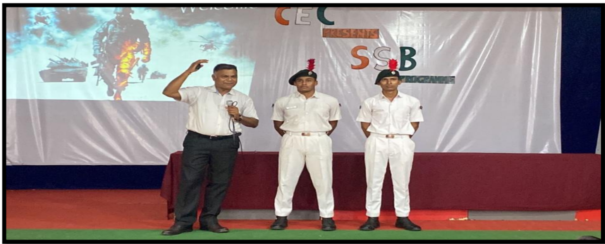
Guard of Honour on 15 -08-2022