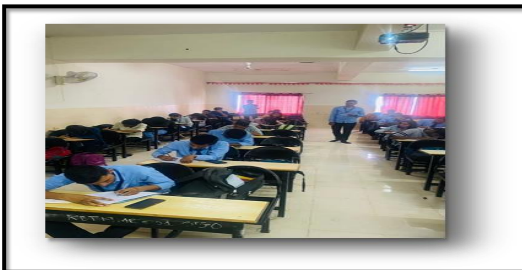
PPDT Session on 23-08- 2022