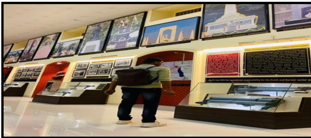
Field visit 2.0 (National War Memorial) on 20-11-2022