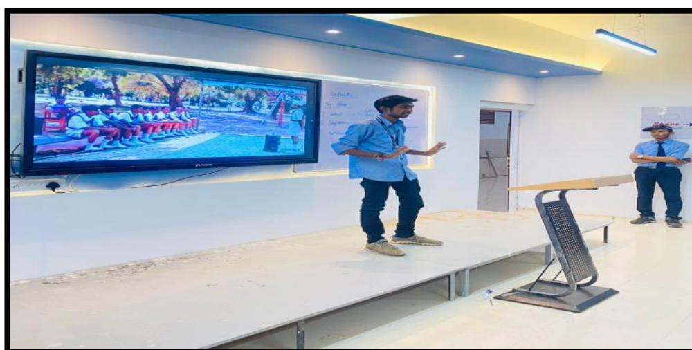
Lecturette Session on 12-10- 2022